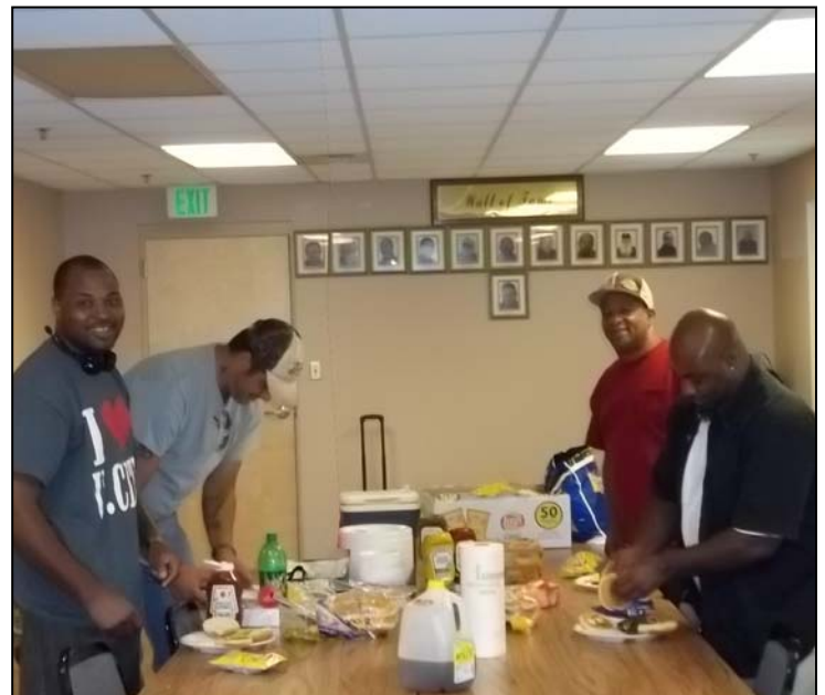
Drivers "chow down" on some of the goodies served at Driver Appreciation Week in Birmingham.